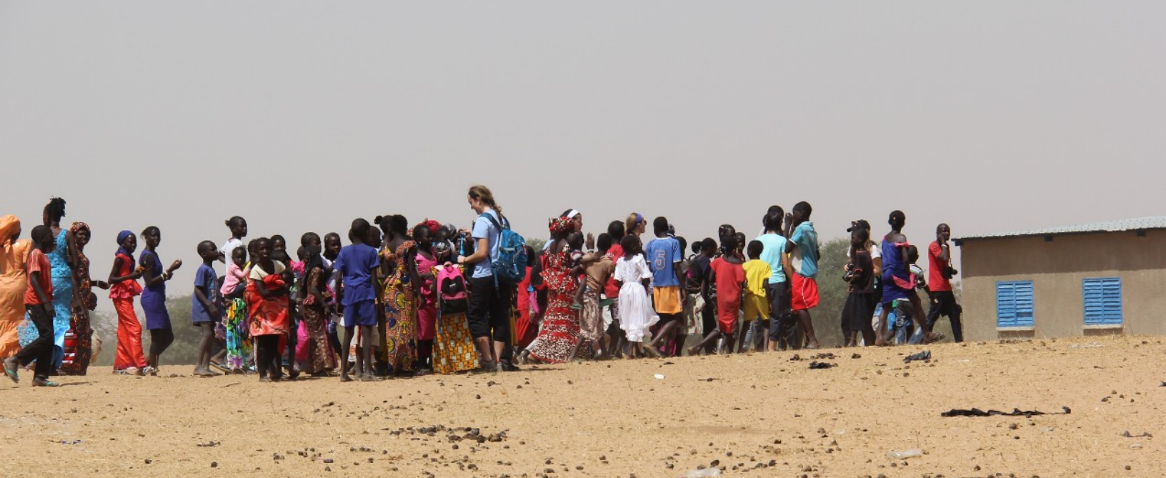
Photo from our February 2016 Trip to Senegal

Our Mission is to expand educational opportunities in Senegal by constructing learning centers, empowering women and girls and promoting cultural exchange.